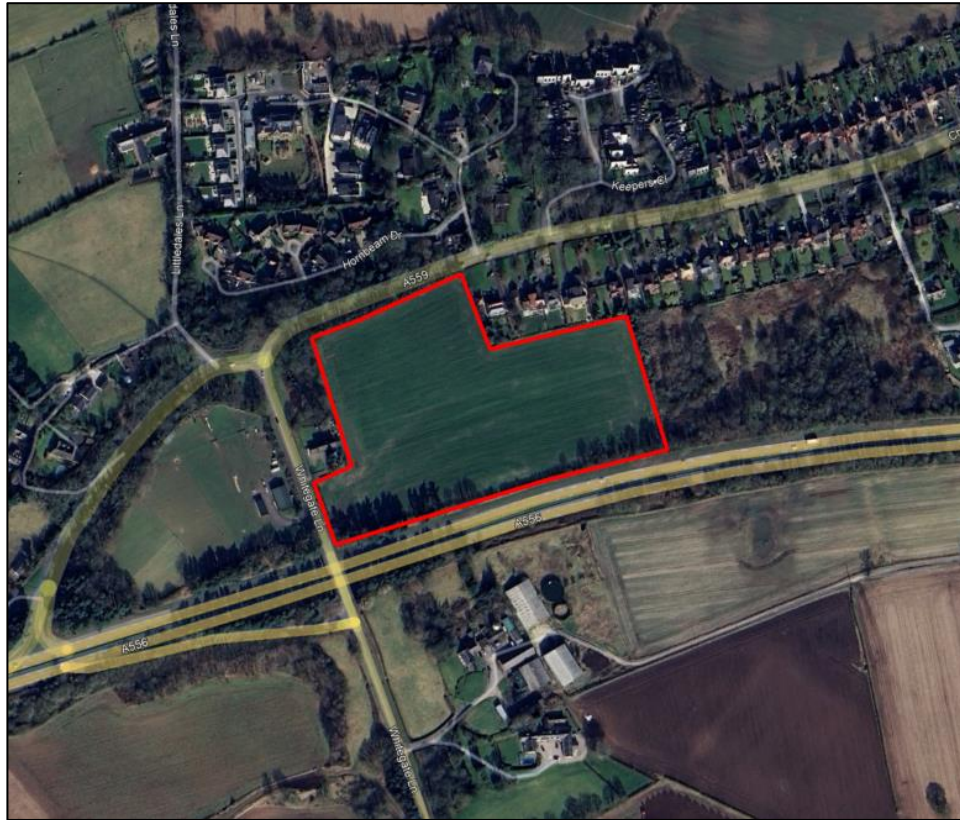
Figure 2: Site outline